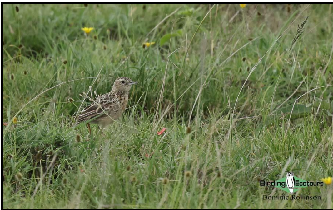
The Critically Endangered Beesley's Lark .

The rest of the afternoon was spent relaxing around the lodge, excitedly contemplating our week on safari in northern Tanzania while enjoying common Arusha birds such as Superb Starling, Variable Sunbird, Red-cheeked Cordon-bleu and Southern Citril .