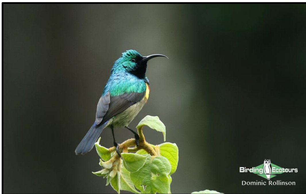
Eastern Double-collared Sunbirds were common along the Elephant Caves Trail.

This morning we decided to spend some time out of our safari vehicle and enjoyed the Elephant Caves Trail of the Endoro section of Ngorongoro Conservation Area. Our local guide, Emmanuel, was waiting for us on arrival and over the course of the morning, we found an impressive array of forest birds, many of which were new for our already large list. Highlights of the morning included Lemon Dove , Schalow's Turaco , Ayres's Hawk-Eagle , Black Sparrowhawk , Narina Trogon , Cinnamon-chested Bee-eater , Moustached Tinkerbird , Pallid and Scaly-throated Honeyguides , African Broadbill , Grey and Purple-throated Cuckooshrikes , Black-fronted Bushshrike , Blue-mantled Crested Flycatcher , Brown-headed Apalis , Grey-capped Warbler , Mountain Greenbul , Brown Woodland Warbler , African Hill Babbler , Mbulu White-eye , Eastern Double-collared Sunbird , Grey-headed Nigrita and Red-throated Twinspot .