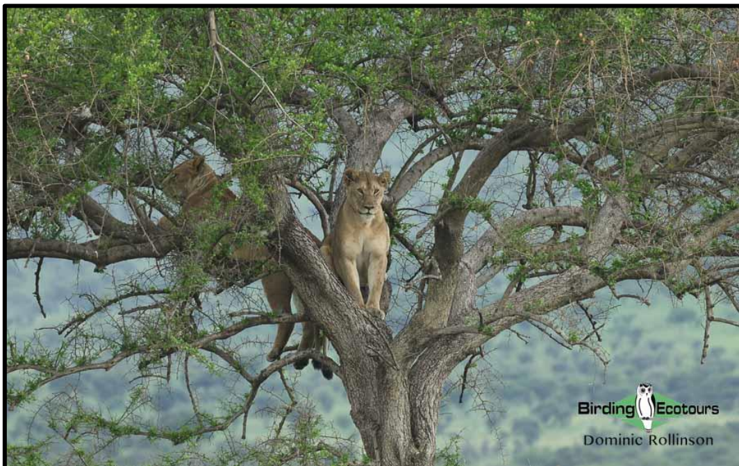
Tree-climbing Lions were seen in the Serengeti.

We had the full day in Serengeti National Park at our disposal today, and after our breakfast, we went out for a game drive, which of course proved incredibly productive. Along our camp's entrance road, we saw many great birds including Coqui Francolin, Grey-breasted Spurfowl, Black-faced Sandgrouse, Double-banded and Temminck's Coursers, Secretarybird, White-headed, Lappet-faced and White-backed Vultures, Dark Chanting and Gabar Goshawks, Nubian Woodpecker, Grey Kestrel, Rufous Chatterer, Silverbird, Quailfinch, Purple Grenadier, Kenya and Swahili Sparrows and Pangani Longclaw . Of course, we were never too far from large mammals and again found the likes of African Elephant, Lion (two females up in a tree), slender, Common Dwarf and Banded Mongooses, Black-backed Jackal, Common Warthog, Tsessebe, Plains Zebra and Masai Giraffe .