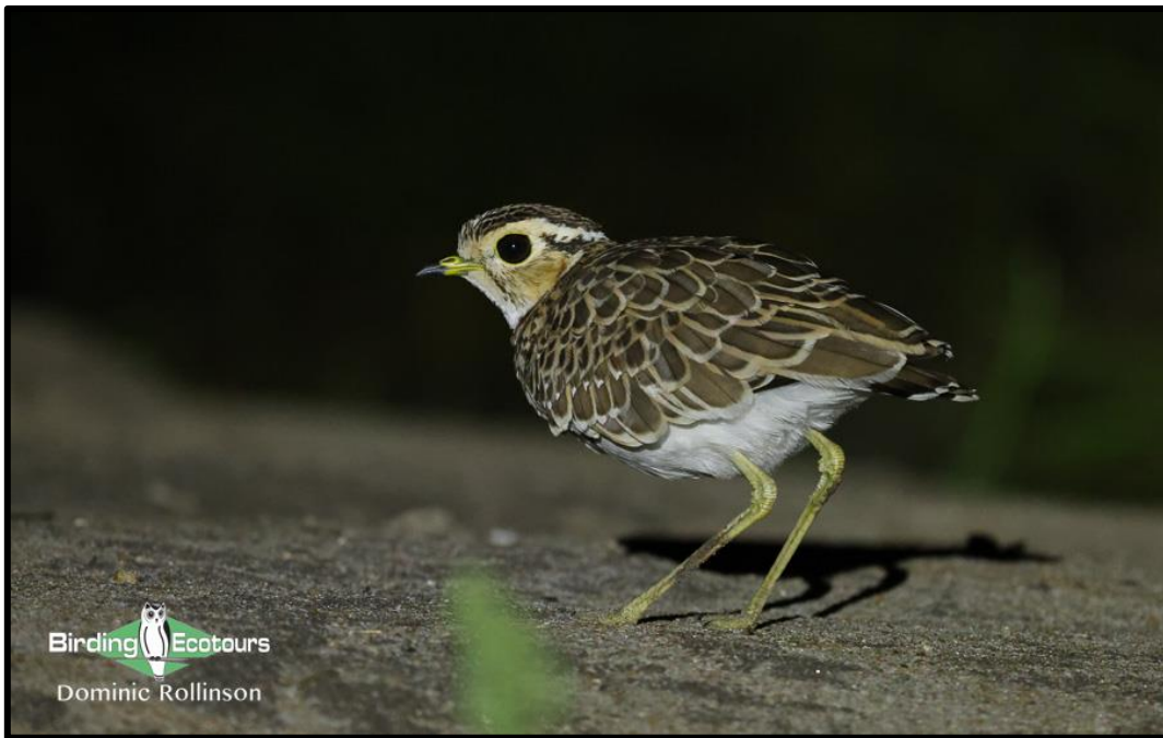
Several Three-banded Coursers were seen on our Tarangire night drive.

The action wasn't yet over for the day though, as after our dinner we had booked onto a night drive, which turned out to be a lot of fun. We had multiple sightings of Verreaux's Eagle-Owls , Bronze-winged and Three-banded Coursers , Spotted Thick-knee and a single Southern White-faced Owl . On the mammal front, we saw Northern Lesser Galago , African Savanna Hare , East African Springhare and Central African Large-spotted Genet . One of the better night drives I've ever been on!