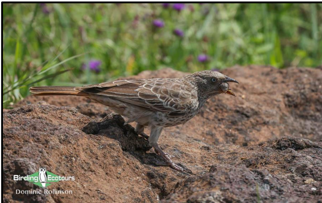
The endemic Rufous-tailed Weaver was seen well on the slopes of Ngorongoro Crater.