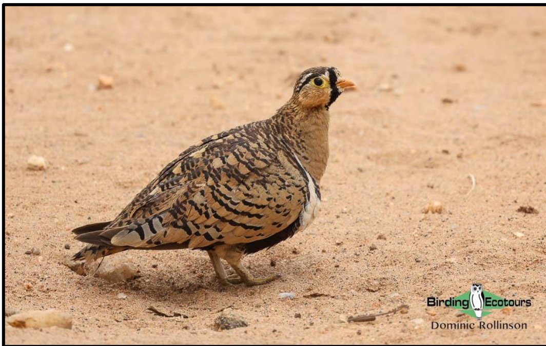
The striking Black-faced Sandgrouse was fairly numerous in Tarangire National Park.

All in all, we recorded 365 species of birds and 38 species of mammals. A detailed daily account can be read below, and the full bird and mammal lists are located at the end of the report.