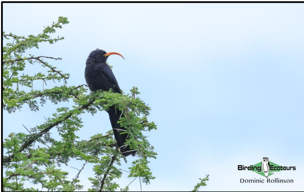
We had great looks at Abyssinian Scimitarbill near Engikaret.

For our final birding of the day, we birded the Oldonyo Sambu area which again proved really productive as we further added Augur Buzzard , Red-fronted Tinkerbird , Red-fronted Barbet , Chinspot Batis , Brubru , Brown-crowned Tchagra , Long-tailed Fiscal , Red-faced Crombec , Red-rumped Swallow , Hildebrandt's Starling , Abyssinian Wheatear , Village Indigobird and Streaky Seedeater . After a successful day out, we decided to head back a bit earlier and enjoy some time off in Arusha in the late afternoon.