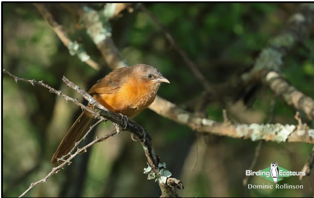
A small group of Rufous Chatterers were seen well at Lake Manyara National Park.

We then spent an enjoyable few hours (with a nice lunch stop in between) traversing the tall woodlands on the edge of Lake Manyara. The highlights were many, with standout species including African Hawk-Eagle , Verreaux's Eagle-Owl , Pearl-spotted Owlet , White-browed Coucal , Green Wood Hoopoe , Crowned and Von Der Decken's Hornbills , Grey-headed Kingfisher , Bearded Woodpecker , Grey Cuckooshrike , Slate-colored Boubou , White-bellied Tit , Rufous Chatterer , Spotted Palm Thrush , Rufous-tailed Weaver , Black Bishop , Village Indigobird and Mountain Wagtail .