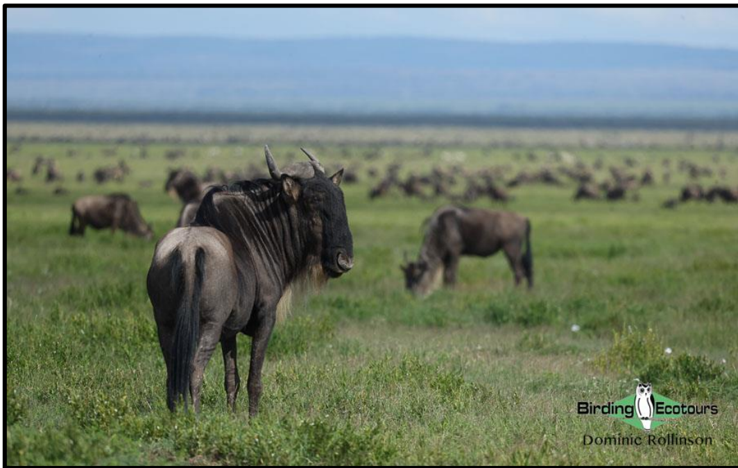
We crossed through massive herds of migrating Blue Wildebeest while in the Serengeti.

As we made our way down from the crater rim, we dropped into the plains and savanna which held a different assemblage of bird species and got our first looks at the impressive wildebeest migration. The numbers of Blue Wildebeest (with smaller numbers of Plains Zebra and Thomson's and Grant's Gazelles ) is difficult to comprehend, with dark figures dotting the landscape as far as the eye can see. As we slowly made our way through the vast herds, we of course saw many interesting birds along the way too. Highlights in the plains included Silverbird, Yellow-billed Oxpecker, Greater Kestrel, Kori and Black-bellied Bustards, Rüppell's Starling, Northern White-crowned Shrike, D'Arnaud's Barbet and Double-banded Courser .