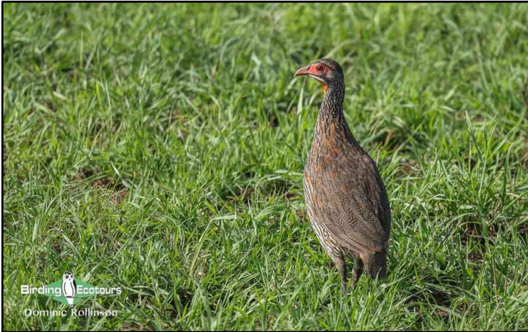
Grey-breasted Spurfowl, a Tanzanian endemic.

a tiring but exhilarating day, we finally made it to our accommodation, where we enjoyed a sundowner drink and a lovely evening meal.