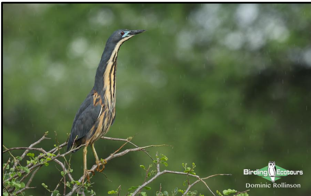
This Dwarf Bittern posed for us in Tarangire National Park.