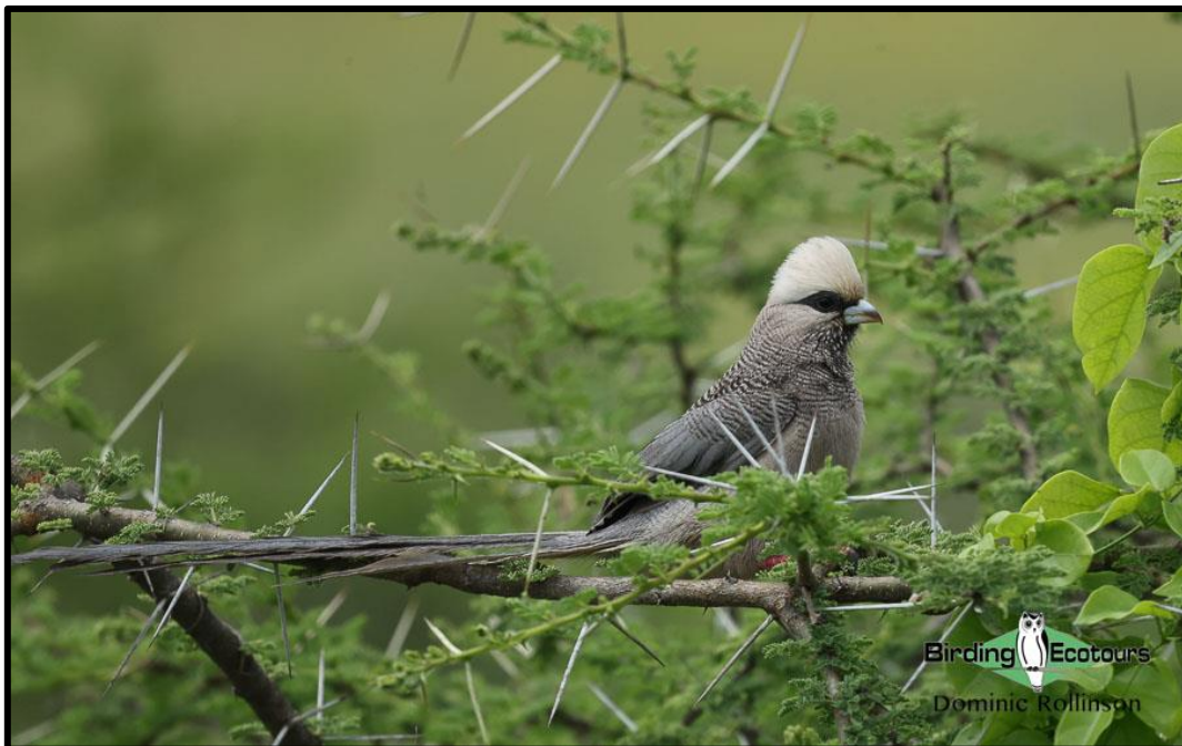
The scarce White-headed Mousebird was seen near the Engikaret Plains.

We then moved to an incredibly productive area of dense trees in a dry riverbed (enjoying views of the Kilimanjaro and its vanishing glacier in the distance en route), where we enjoyed a bird-interrupted picnic lunch. Some of the special birds we came across included Namaqua Dove , White-bellied Go-away-bird , Lappet-faced Vulture , White-headed Mousebird , Abyssinian Scimitarbill , Little Bee-eater , Bearded Woodpecker , Pygmy Batis , Slate-colored Boubou , Rosy-patched and Grey-headed Bushshrikes , Red-throated Tit , Grey Wren-Warbler , Red-fronted Prinia , Banded Parisoma , Bare-eyed Thrush , Yellow-spotted Bush Sparrow and Black-faced Waxbill .