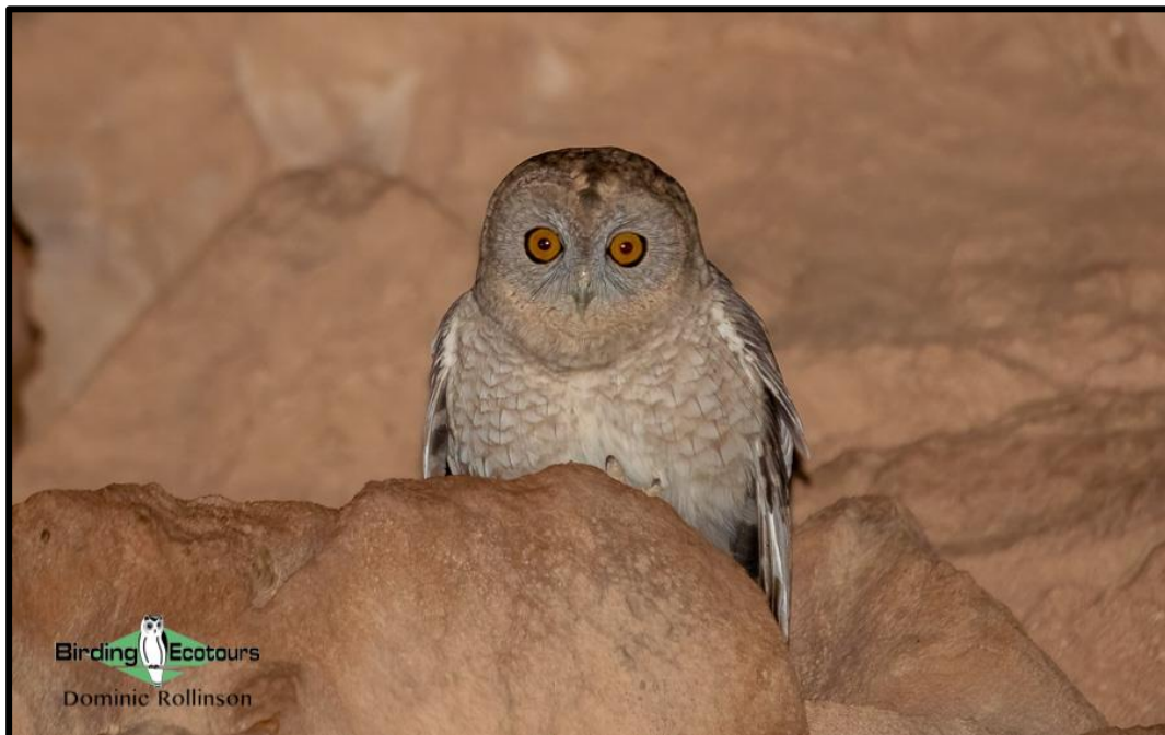
Desert Owl is a major tour target which we hope to find in southern Oman.

Some of the key targets on this varied tour include the enigmatic Omani Owl and Forbes-Watson's Swift , along with many species endemic to the Arabian Peninsula, such as Arabian Partridge , Arabian Scops Owl , Arabian Eagle-Owl , Desert Owl , Arabian Green Bee-eater , Arabian Babbler , Tristram's Starling , Arabian Wheatear , Arabian Sunbird , Yemen Serin , and Arabian Golden-winged Grosbeak . We also seek range-restricted species like Sand Partridge , Arabian Warbler , and Palestine and Nile Valley Sunbirds , as well as wintering migrants like Plain Leaf Warbler and Eversmann's Redstart to name just a few. During our Oman birding tour, we will explore the foothills and heights of several different mountain ranges, from the rugged Al Hajar and Jebel Akhdar mountains in the north, with their dramatic canyons and ancient terraced farms, to the Dhofar mountains in the south, where mist-covered hills and unique vegetation create a striking change in the scenery. Due to the Khareef monsoon season, the Dhofar slopes are transformed into a lush, green oasis for part of the year, creating a home for a unique bird community of Arabian, African, and Asian species.