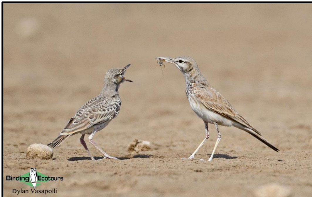
Greater Hoopoe-Lark – a unique species that we hope to find in the desert near Mughshin.

Overnight: Qatbit Hotel, Mughshin (please see the “Accommodation Note” below).