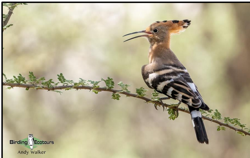
The beautiful Eurasian Hoopoe is widespread across Oman.