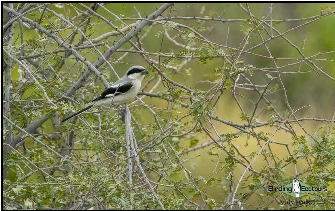
The endemic Arabian subspecies of Great Grey Shrike is easily seen in Oman.