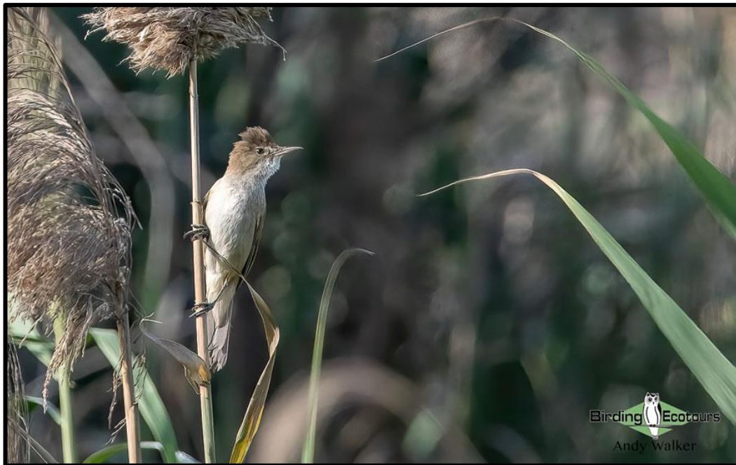
Clamorous Reed Warbler is a bird of wetlands and oases.