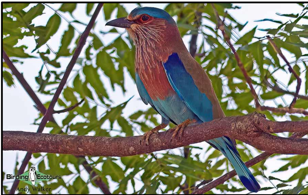
Stunning Indian Rollers are common in northern Oman lowlands.

Overnight: Salalah Gardens Hotel, Salalah