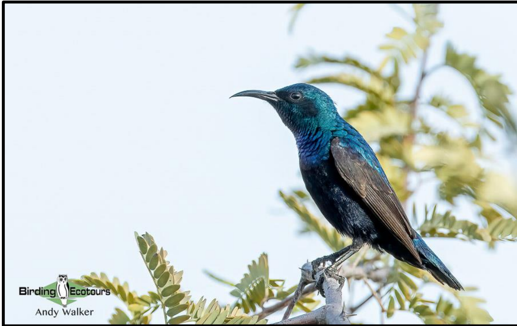
Gorgeous Purple Sunbirds are satisfyingly common across northern Oman.