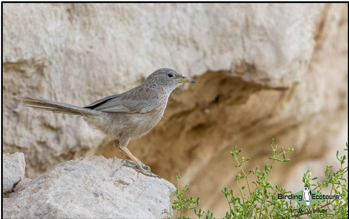
Arabian Babbler is a charismatic species endemic to the Arabian Peninsula.

05 – 16 NOVEMBER 2025 04 – 15 NOVEMBER 2026