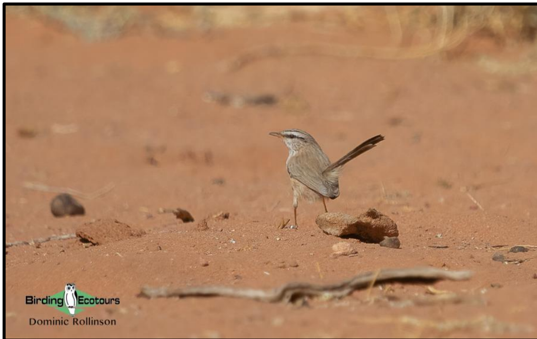
Streaked Scrub Warbler is a very active species, full of character.