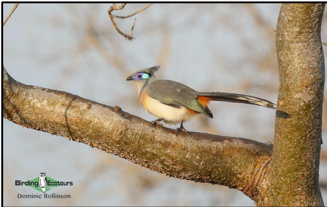
The attractive Crested Coua is just one of a few coua species possible on this tour.