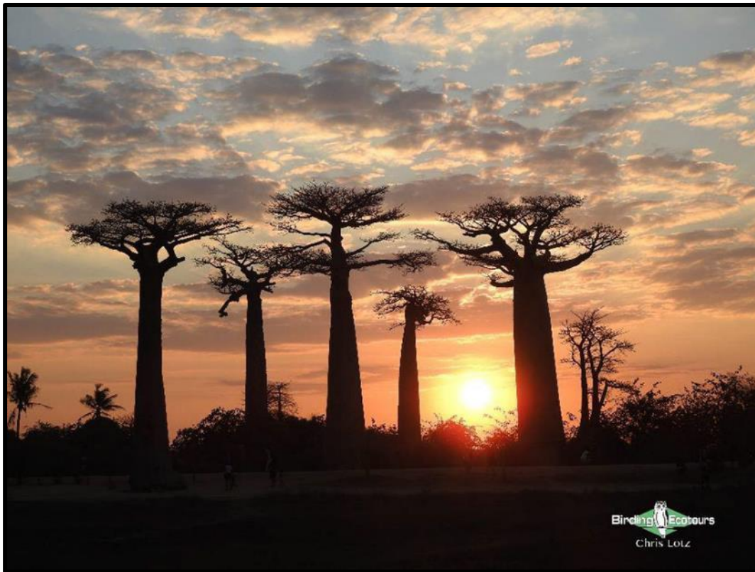
Sunsets at the "Avenue of the Baobabs" are out of this world!

Overnight: Palissandre Cote Ouest , Morondava