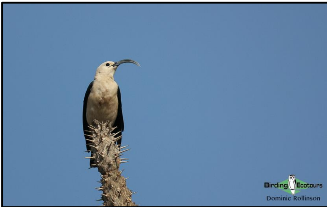
Sickle-billed Vanga is just one of several vanga species on this tour.

The mammals on offer are equally alluring, and we'll look for several lemur species, including the impressive Verreaux's and Van der Decken's Sifakas and a few nocturnal species, for which a night walk is required. Perhaps the best of all our mammal targets is the island's largest carnivore, Fosa , which we will search for during our time at Kirindy Forest Reserve . This tour also has some of the best scenery in Madagascar, and we'll be sure to take in the sights of the famous " Avenue of the Baobabs " during our time in Morondava.