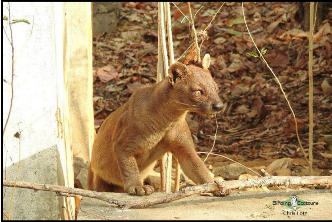
Fosa is seen with some regularity in Kirindy Forest Reserve.