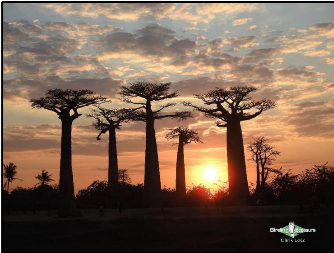
Sunsets at the "Avenue of the Baobabs" are out of this world!

Overnight: Palissandre Cote Ouest , Morondava